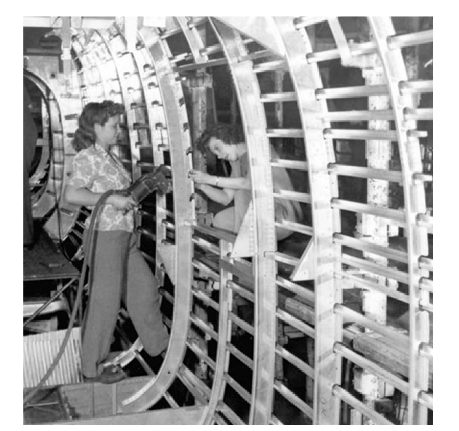
Women Assembling an Airframe, One with a Rivet Gun, Courtesy of San Diego Air and Space Museum.

The Navy is committed to fulfilling all of its requirements under the National Historic Preservation Act and welcomes your input.