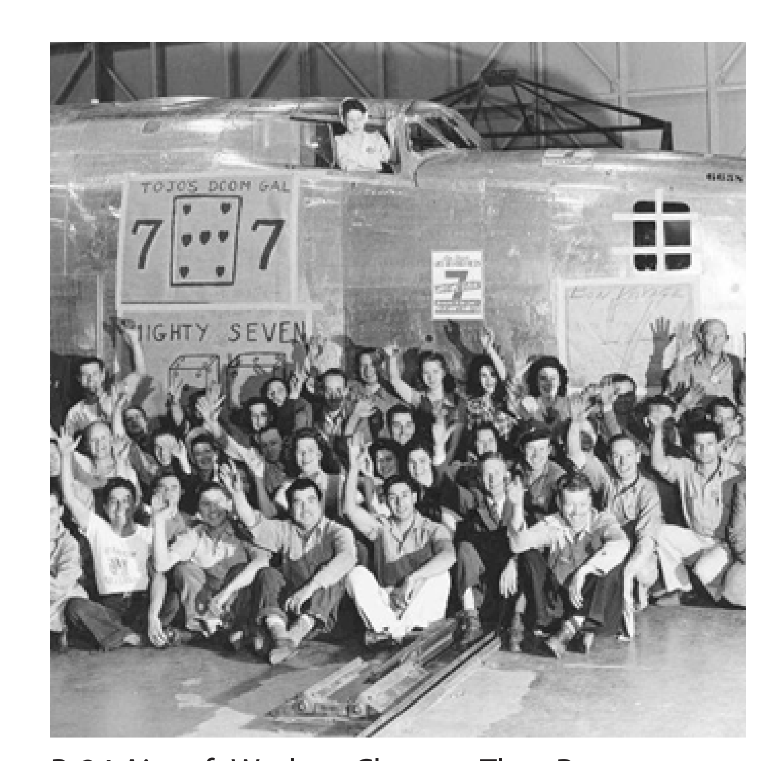
B-24 Aircraft Workers Cheer as They Pose with the Last B-24 Produced in San Diego, Courtesy of San Diego Air and Space Museum.